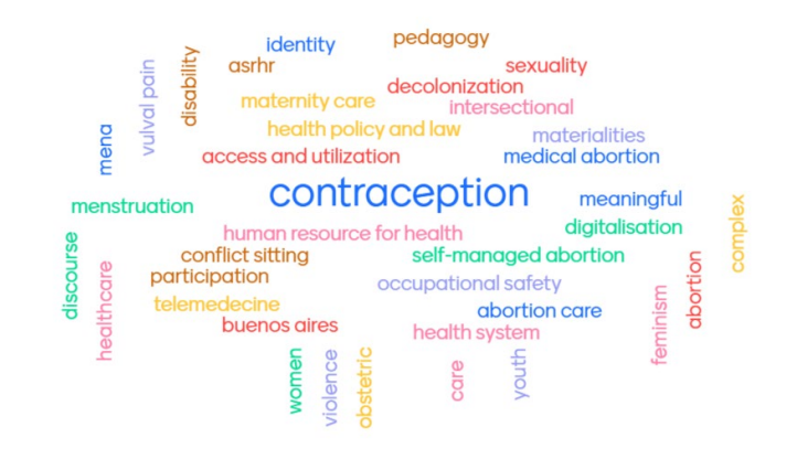
The word cloud above gives an indication about what to expect content-wise at the 9<sup>th</sup> Annual Meeting on Linking research, policy and practice (taking into considerations that not all young researchers were present during the workshop to contribute with their keywords).

Moving between different conference rooms has never been easier: As a participant you can decide on the day of the meeting which of the two parallel sessions you prefer to attend. We recommend to already <u>have a look at the programme</u> beforehand and see whether you're more inspired to attend Session 1: Menstrual, vulva and obstetric care or Session 2: Social, cultural and organisational norms change. Later on, you will have to make a decision between Session 3: SRHR services and reproductive care or Session 4: Sexuality, sexual pleasure and LGBTI health.