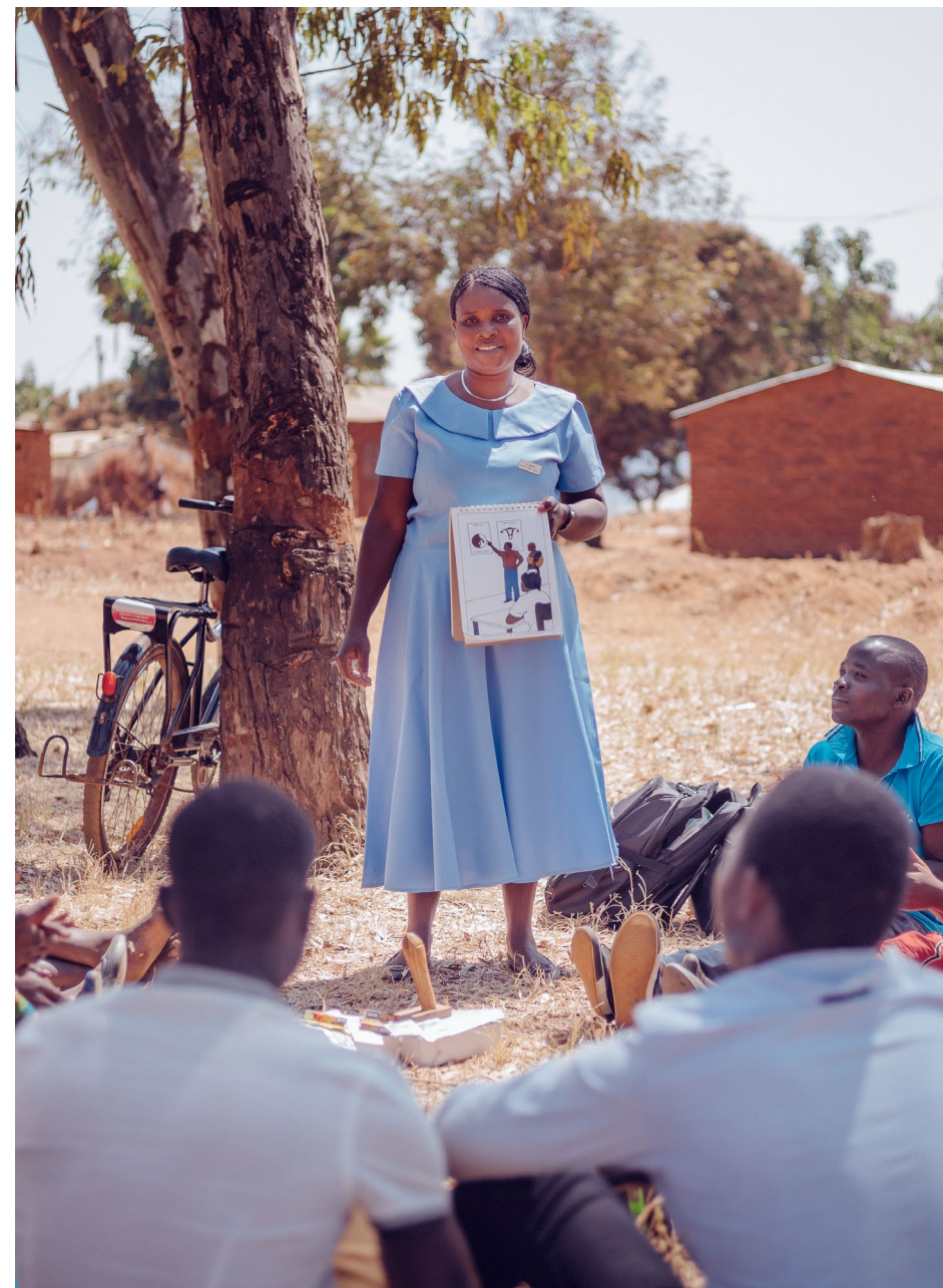
Amref and its partners advocate for the integration of CHWs into national health systems as a way of ensuring they receive the training, guidance, resources, and supervision they need.