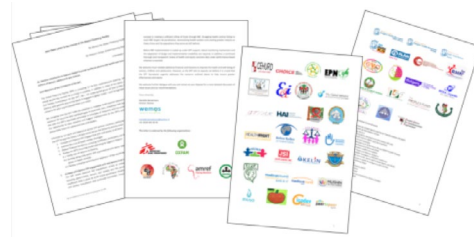
Joint open letter to GFF Secretariat, 5 november 2018

for the expansion of the GFF to 50 countries - in November 2018, was endorsed by 50+ organisations and was publicly acknowledged by the GFF management during the meeting. The letter outlined several critical issues regarding lack of CSO engagement in key processes, failure to address health worker shortages and shortfalls