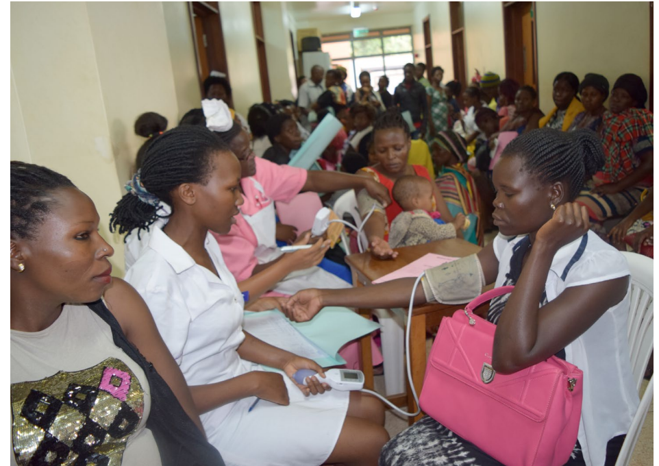
Pregnant women at a health facility in Uganda have their blood pressure measured.

Related to this, an important thing to consider when advocating, is the language and tools you use. In other words, you need to tailor