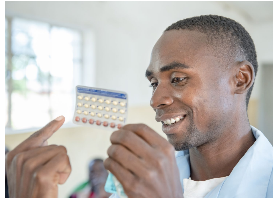
Amref's research concentrated on the factors that influence CHWs' role in, for example, promoting family planning.

When government funding for community health programmes is limited, non-governmental organisations (NGOs) become a powerful complementary source for supporting CHWs. Coordinating their involvement can be challenging, though. One informant interviewed in Malawi estimated that Mangochi district had as many as 30 NGO partners for community-level SRH, but complained, "They're confined in one place; they aren't distributed." His commentary was