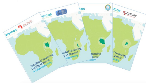
GFF country papers