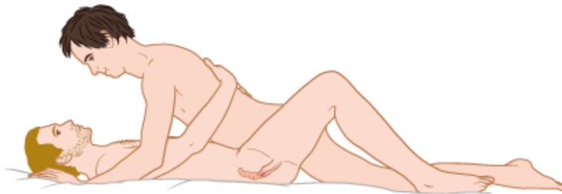
Image: this image shows the anatomy of anal sex between two people with penises from Pharos