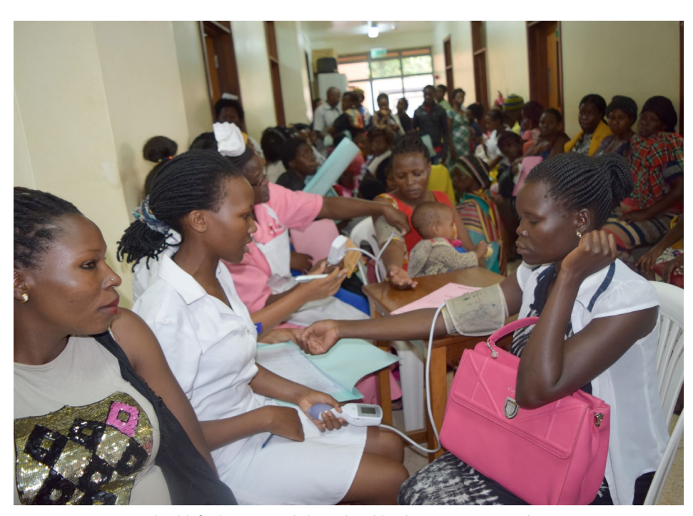
Pregnant women at a health facility in Uganda have their blood pressure measured.

Related to this, an important thing to consider when advocating, is the language and tools you use. In other words, you need to tailor