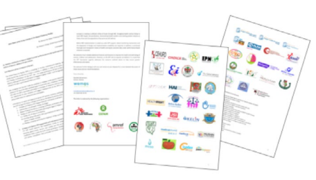
Joint open letter to GFF Secretariat, 5 november 2018

for the expansion of the GFF to 50 countries - in November 2018, was endorsed by 50+ organisations and was publicly acknowledged by the GFF management during the meeting. The letter outlined several critical issues regarding lack of CSO engagement in key processes, failure to address health worker shortages and shortfalls